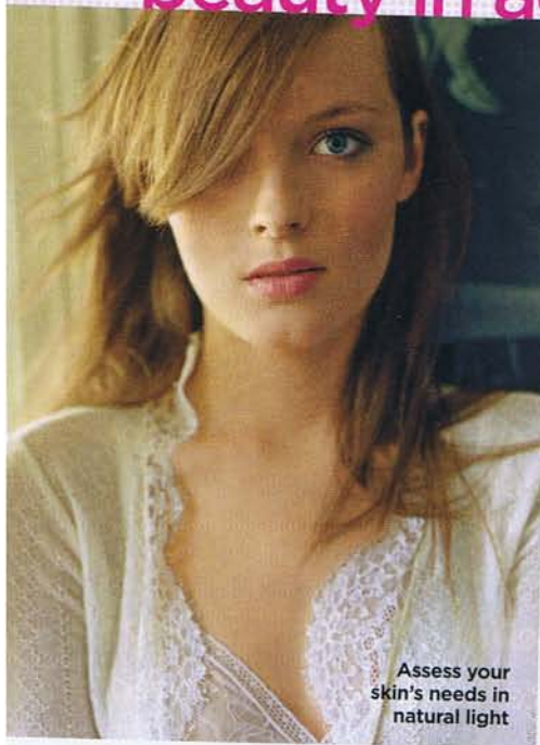
Assess your skin's needs in natural light

Aveeno Ultra-Calming Moisturizing Cream Cleanser ($7; at drugstores), with calming feverfew, is suitable for most skin types, a.m. and p.m.