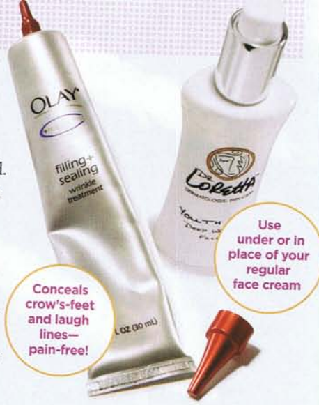
Conceals crow's-feet and laugh lines—pain-free!

By now the only thing left to contend with may be a few pesky lines. Surprisingly, some of the latest cures come in a bottle—not a syringe—and can be used in the morning and at night in place of your moisturizer or cream. "Many women can't afford wrinkle-erasing injections or are squeamish about needles," says Loretta Ciraldo, M.D., a dermatologist in Miami. "That's why some companies are offering what I call 'surgical substitutes.'" These are topical solutions that mimic the effects of injectables, albeit not as