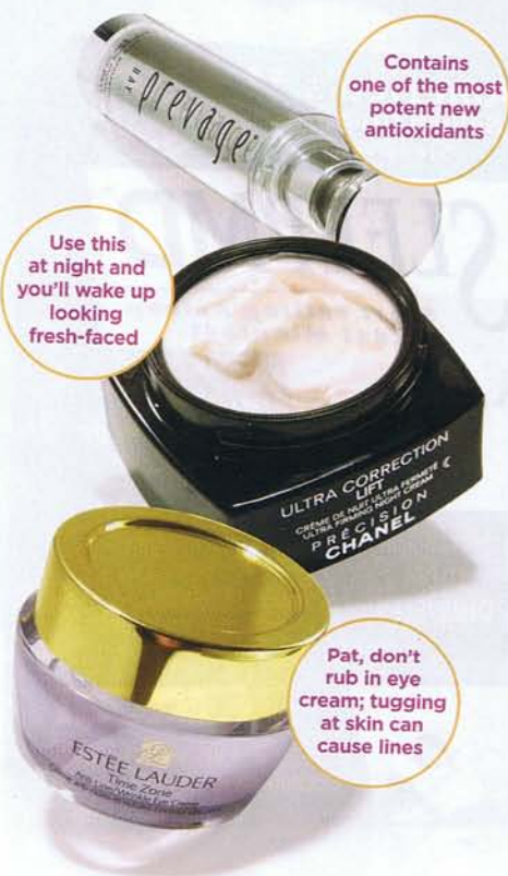
Contains one of the most potent new antioxidants

■ Sunscreen The most essential part of any skincare routine is daily, year-round use of a broad-spectrum sunscreen with an SPF 15 or higher. (Make life easier by choosing a moisturizer that incorporates one.) We like Shiseido Future Solution LX