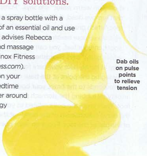
Dab oils on pulse points to relieve tension

→ Spritz yourself happy "Fill a spray bottle with a cup of water and five drops of an essential oil and use it as an aromatherapy spray," advises Rebecca Vogdanos, an aesthetician and massage therapist at the upscale Equinox Fitness club in Chicago ( equinoxfitness.com ). "Mist jasmine-infused water on your sheets to help you relax at bedtime or spray juniper-scented water around your office for a midday energy boost." Find essential oils at auracacia.com . ▶