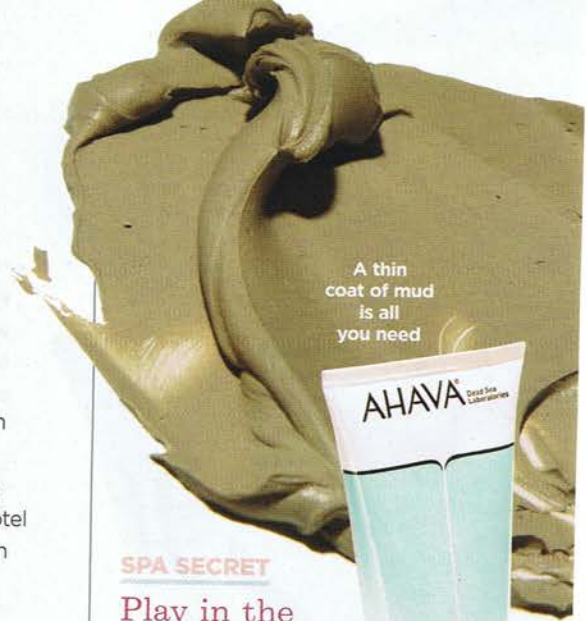
A thin coat of mud is all you need